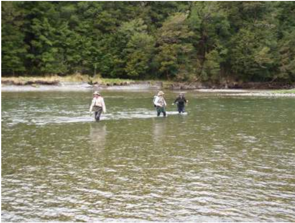
Crossing the Maruia on the November South Island Trip